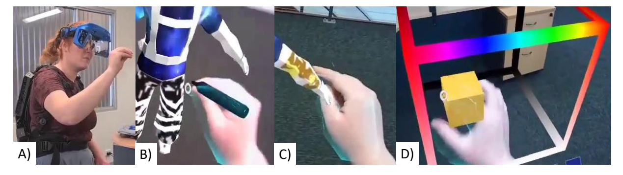
Figure 1: We present 3DCoIAR, an art application that aims to explore painting 3D models and color selection approaches. A) A user wearing an AR HMD, B) can use either a virtual pen or C) their fingertip. D) We also expand typical 2D color picker interfaces, allowing for 3D space representation of color spaces.

Mark Billinghurst<sup>‡</sup> University of South Australia